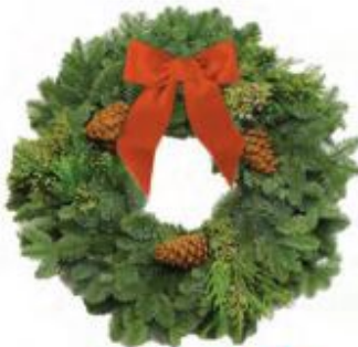
Noble Fir Mixed Wreath 20", 36" P1 P2