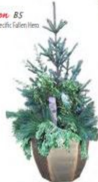
32" Outdoor Evergreen Planter B9