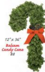
12" x 36" Balsam Candy Cane B8