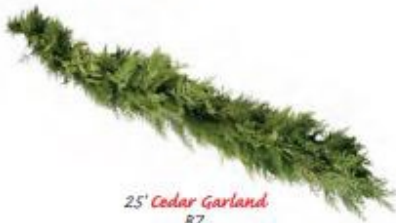
25' Cedar Garland B7