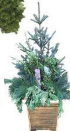
42" Outdoor Evergreen Planter B10