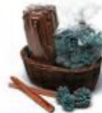
Fire Starter Basket P8

B Products primarily for outdoor use. P Products primarily for indoor and outdoor use.