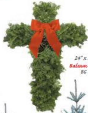
24" x 36" Balsam Cross B6