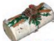
12" Holiday Yule Log P7