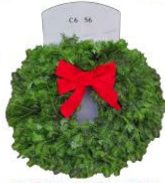
26" Fallen Hero Wreath Donation B5 Delivered to a National Cemetery to Honor our Veterans No Specific Fallen Hero