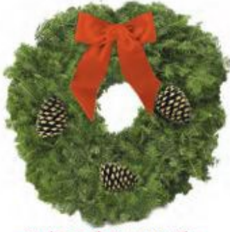
Single Face Christmas Wreath 24", 30" Fir, 40", 60" Balsam B1 B2 B3 B4