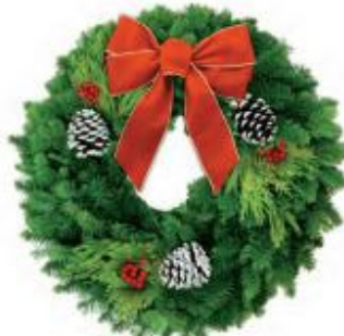
24" Premium Decorator Boxed Wreath P3