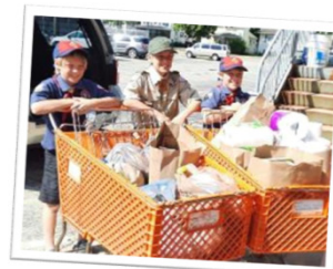
Parent Orientation Guide pages 9-14